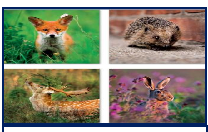
Year 1 -British Birds and Mammals

Fieldwork-Recording on a tally. (Identifying the best location to add a new bin at the Playing Fields.)