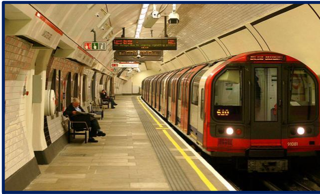
Year 1 –All Aboard